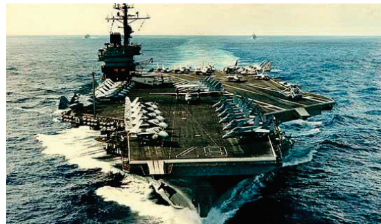
▲ USS Kennedy aircraft carrier, fitted with H300 bilge pumps