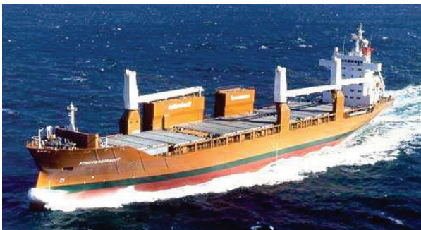
▲ MV Schippersgracht container vessel, fitted with H400 sludge pumps

An example of their superiority for this class of work is their adoption by the U.S. Navy as a standard pump on all warships and auxiliary vessels for transporting waste oils from slop tanks to shore treatment facilities. The Megator Sliding Shoe Positive-Displacement Pump, constructed to its normal marine standards, is equal in quality to the stringent requirements of military specifications.