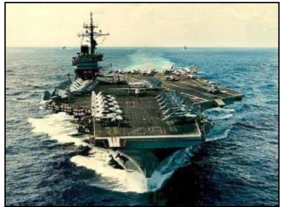
📍 USS Kennedy aircraft carrier, fitted with H300 bilge pumps