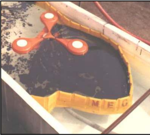
Preventing an oil spill from contaminating a tank.