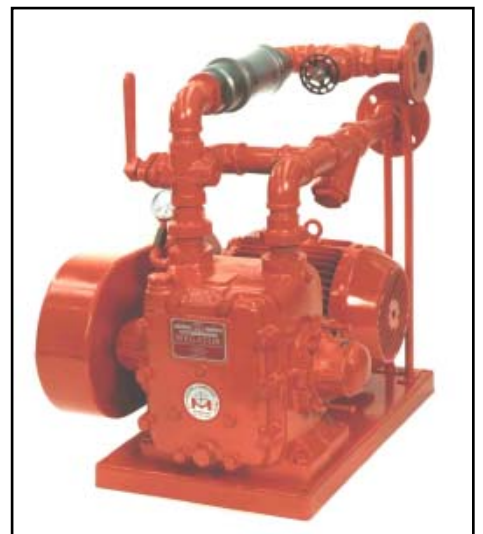
🔦 L125 fuel oil pump