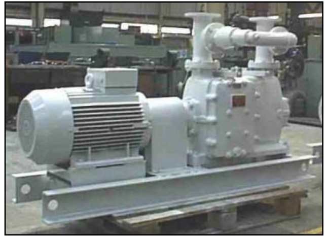
🔦 L400 bronze bilge pump, 220 gpm capacity