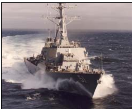
📍 US & Royal Navy approved.