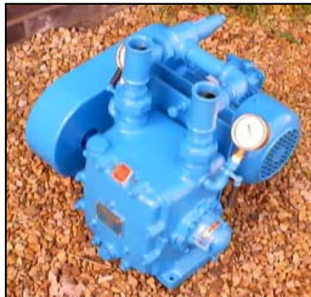
📍 L125V Bilge pump