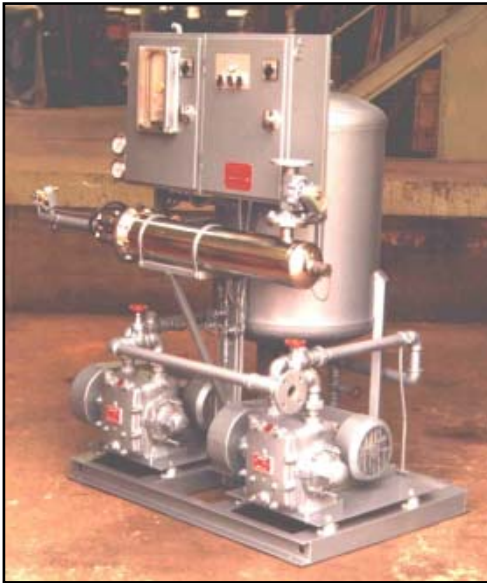
🔦 Twin pump marine pressure set, incorporating UV sterilizing unit