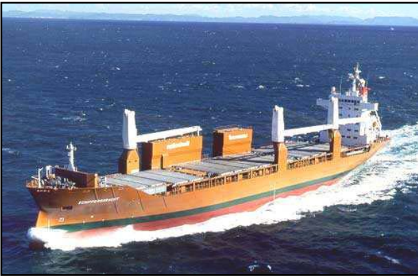
🔦 MV Schippersgracht container vessel, fitted with H400 sludge pumps