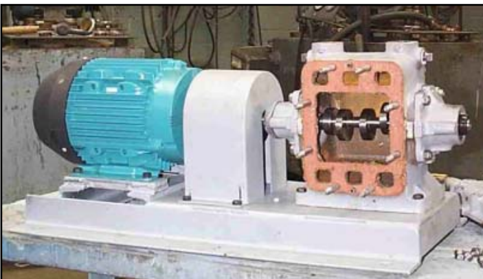
🔦 Simple construction makes for rapid, unhampered maintenance inspection