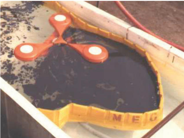
▲ Preventing an oil spill from contaminating a tank.