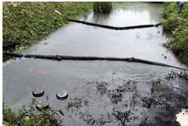
▲ Oil recovery from a pond