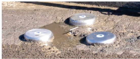
▲ Sewage scum removal