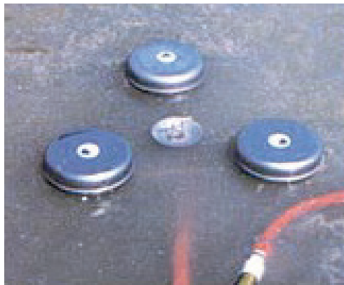
▲ Effluent removal at a chemical plant