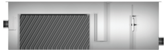
▲ Separator internals