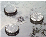
Oil from Ponds