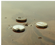
Oil from Interceptors