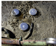
Sewage Scum from Aerator Tanks