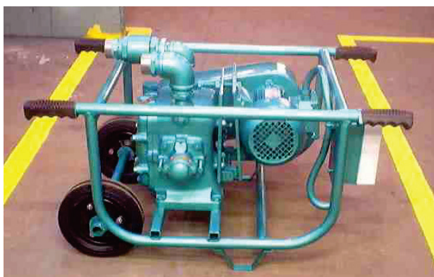
◀ L100 electric driven set mounted on a stretcher frame complete with starter.

All sizes of Megator pumps can be supplied as mobile units, on many different types of portable base.