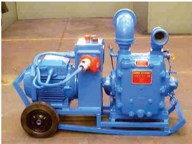
◀ L150 Aluminium direct coupled set complete with starter, mounted on a stretcher frame. Supplied to the Royal Navy for grey water pumping duties.

All sizes of Megator pumps can be supplied as mobile units, on many different types of portable base.