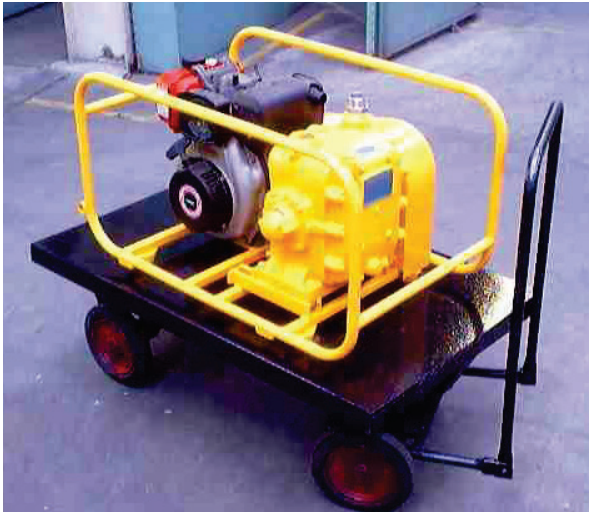
▲ L150 diesel driven set, mounted on turntable trolley